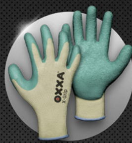
OXXA X-GRIP 51-000 Art. no. 1.51.000.00