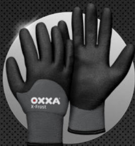
OXXA X-FROST 51-860 Art. no. 1.51.860.00